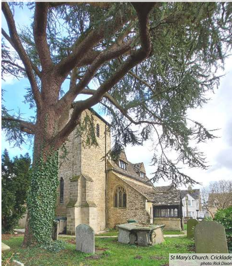
St Mary's Church, Cricklade